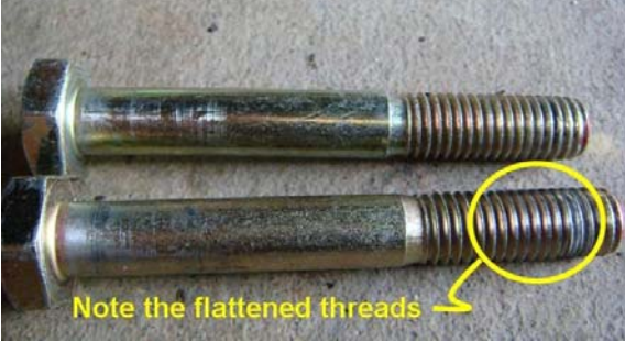
The above examples show minor wear, but an upgrade is recommended.