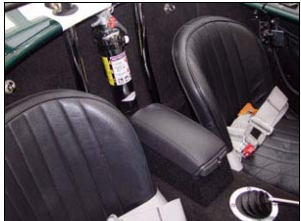
Console with 2.5 lb Fire Extinguisher

The console is 16" long, 6" wide and 6.5" high with approximately 250 cubic inches of storage.