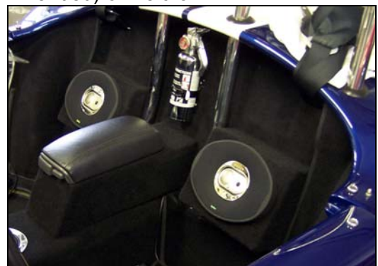
Flush Mount Speaker Boxes

The Flush Mount Speaker Boxes are designed specifically for the Mk III to work effectively behind the seats with no cutting of the bulkhead required. They are covered with carpet matching the interior carpet giving them a factory installed appearance. The speaker boxes mount to the rear bulkhead behind the seats with two small screws per box (recommended) or Velcro.