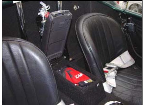
Hinged Lid with Internal Storage

angles with that of the Mk III. Original style carpet material is utilized on front and side surfaces to enhance the OEM appearance of the entire assembly.