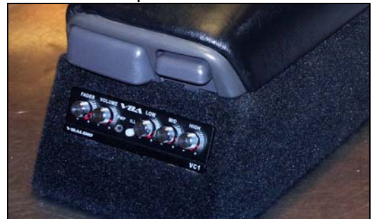
Audio System Controls

The Console mounted pre-amp can be added at the time of Console purchase.