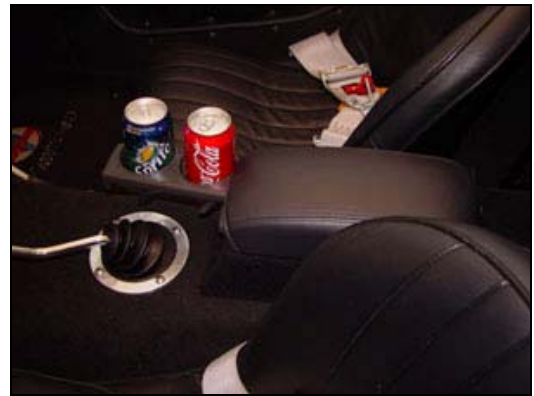
Two Position Cup Holder

The left tab raises the lid. The right tab slides out to provide a two position cup holder.